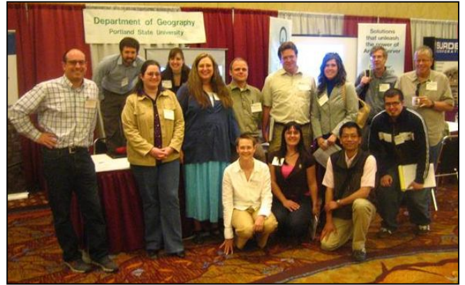
Portland State university students, past and present, along with current faculty at the GIS in Action Conference 2009.

This year's GIA was something of a challenge given the state of the economy. In the end, the conference attendance was near 225 including regular registrants and students. The student attendance was significantly higher than in the past which is very desirable. The program was well received and the feedback I received was all positive.